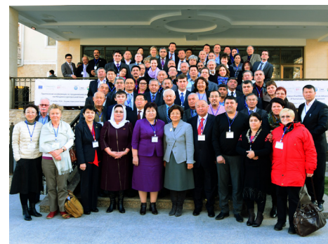
Participants and guests of the Central Asian Practitioners' Conference on Advancement of Sustainable Pasture Management. Kyrgyzstan.

Many different projects and donor funded initiatives are continuously contributing to the identification of solutions and provide support. Up to date a number of pilot initiatives in Tajikistan have been able to show different locally-applicable approaches to sustainable natural resource use and pasture management. At the latest gathering of practitioners and experts devoted to pasture management, on Aug 28th, 2013 it was noted that there is weak and inconsistent organization of networking/ coordination and knowledge exchange among pasture related stakeholders, as well as lack of synergies in activities. Participants have expressed their interest and necessity to have an informal "Pasture Management Networking Platform".