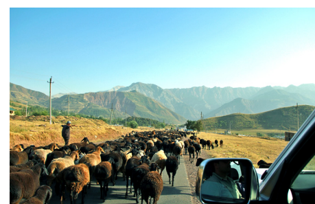
Domestic animal flocks walking on a public road in Garm, Rasht district.