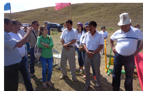
Exchange visits on pasture management to Kyrgyzstan.

Thus the platform will provide for continued and consistent exchange of knowledge and experiences and joint learning; for systematic and standardized identification and documentation of good practices and promotes dissemination; contributes to the development and implementation of pasture management policy in Tajikistan.